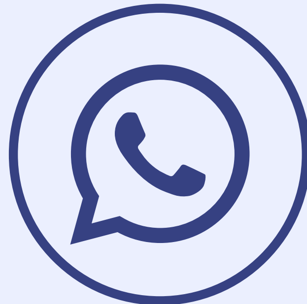
24/7 Emergency Support