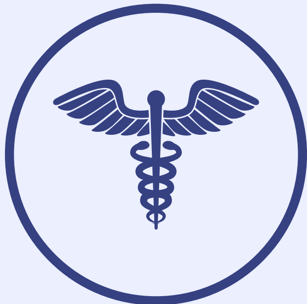
International Health Insurance