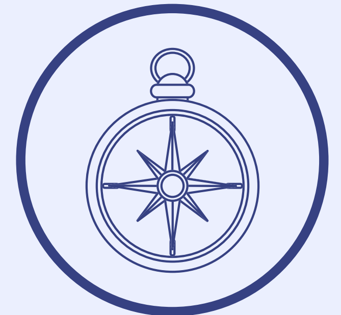
Program Execution & Support