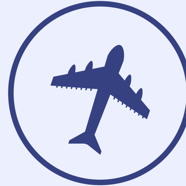
Group Flight Arrangements